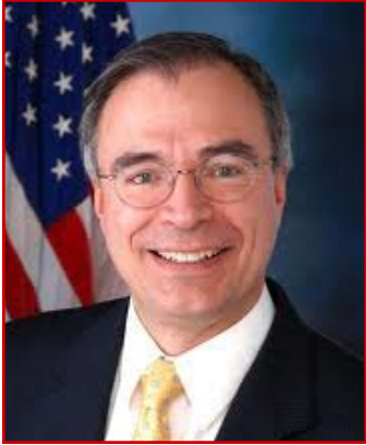
Congressman Andy Harris

Kent Island District Office (410) 588-5670 Website: harris.house.gov