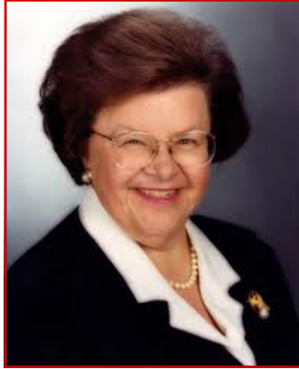
Senator Barbara Mikulski

Kent Island District Office (410) 588-5670 Website: harris.house.gov