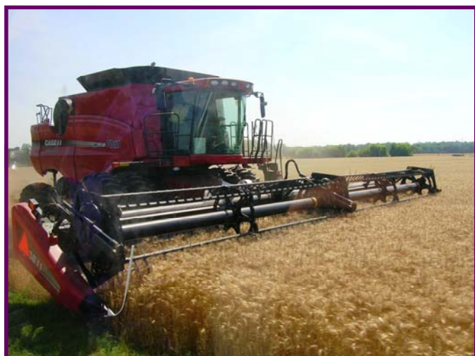
The tour featured Phil Foster of Phil Foster & Sons using a draper head to combine wheat just off of Tarbutton Mill Road.