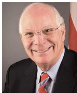
Senator Benjamin L. Cardin Dist. Office in Baltimore (410) 962-4436 Website: cardin.senate.gov