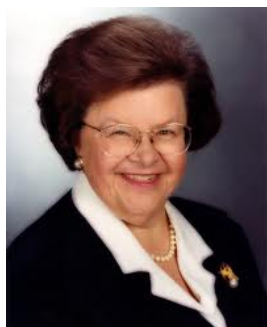
Senator Barbara Mikulski Dist. Office in Salisbury (410) 546-7711 Website: mikulski.senate.gov