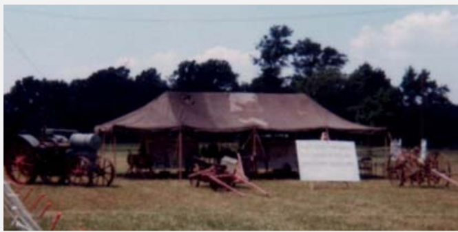
Jock Luthy's old tent used for Farm Bureau County Fair Display