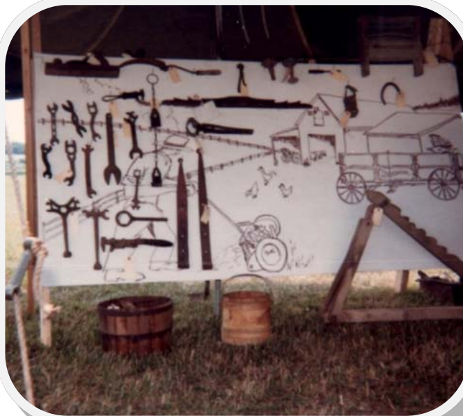
One of the old tools display boards