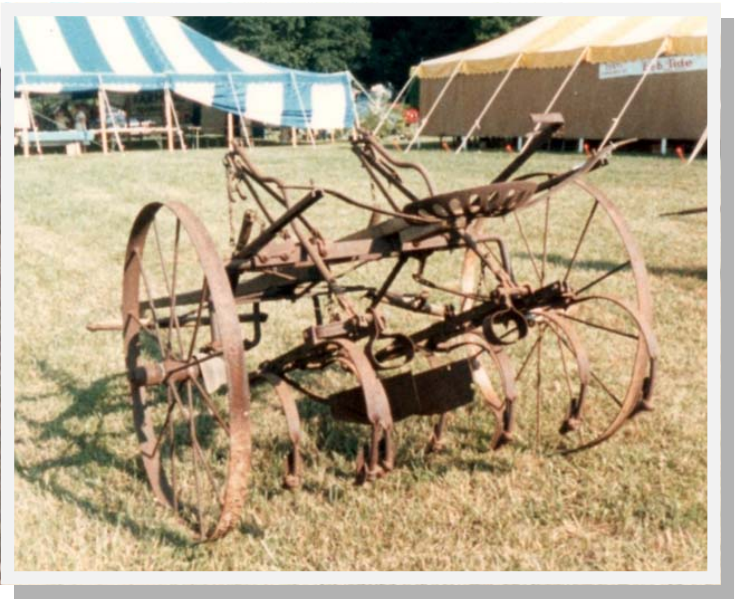
Horse drawn cultivator