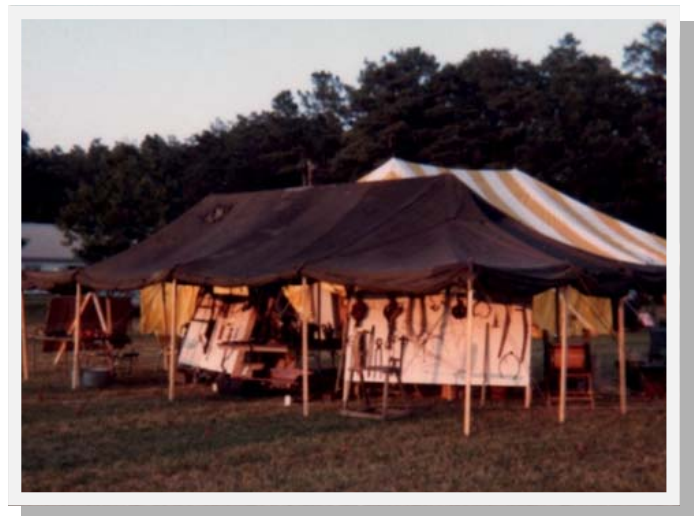
Old tool displays under tent for Farm Bureau County Fair Display