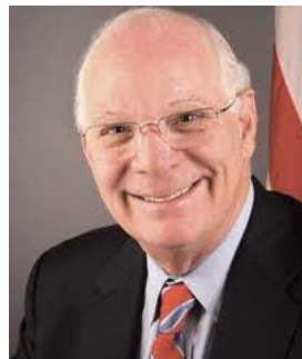
Senator Benjamin L. Cardin Dist. Office in Baltimore (410) 962-4436 Website: cardin.senate.gov