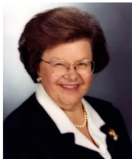
Senator Barbara Mikulski Dist. Office in Salisbury (410) 546-7711 Website: mikulski.senate.gov